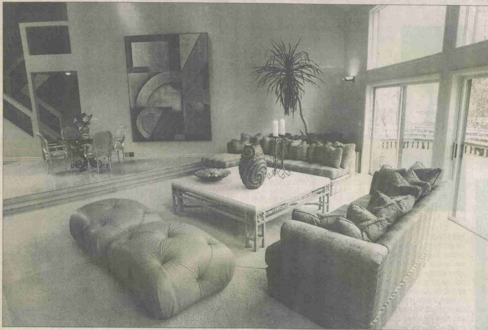
Contemporary seating adds to the versatility of a Morristown great room, designed by James Girouard; the live tree and oversized painting both take advantage of the ample natural light.